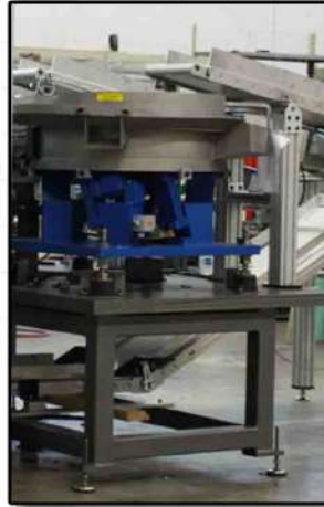
2. The terminals proceed into the bowl feeders where they are single filed in the correct orientation.