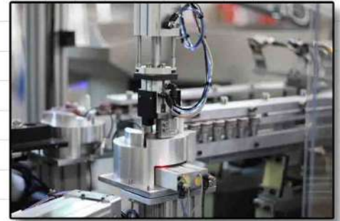
3. The single lane of terminals are conveyed to the pick and place device.