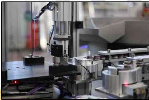
4. The pick and place device selects one terminal from each bowl feeder discharge lane and places it into the waiting transfer pod.