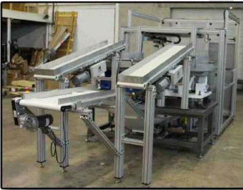
1. Battery terminals are loaded onto the respective infeed conveyors.

Once the specifications were established, Kinesys Automation went about the task of designing a system to eliminate the labor. When Kinesys Automation finalized the engineering for this project, a design review was executed, meeting the customer's expectations.