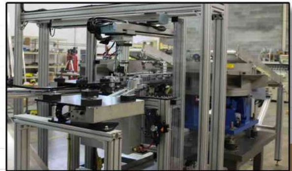
5. The loaded transfer pod transporter moves along its track to the respective robot, whereby the terminals are removed and placed into the molding machine.